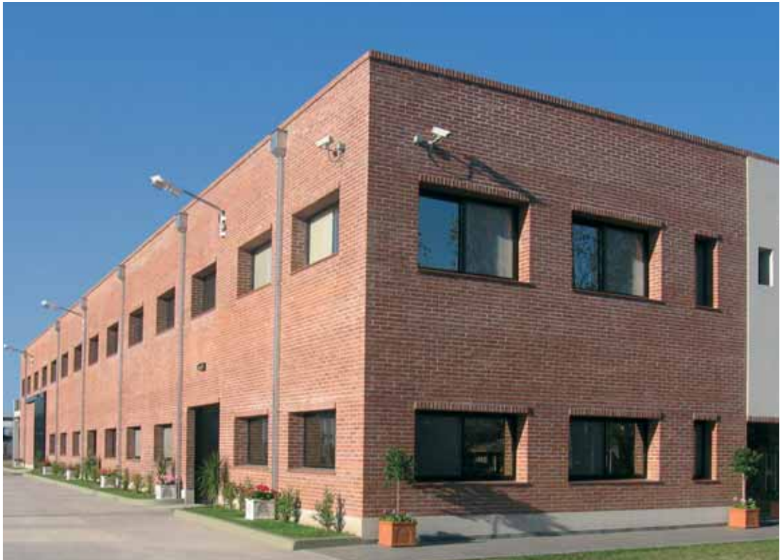
The new Libertini factory on the verge of completion (still so new that logos have not yet been mounted on the façade), 1500 square metres dedicated to the goal of high precision.

M.L.: We have 30 members of staff and this includes administrative staff, operators, controllers and pro-